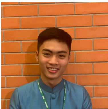
Silasack Silavongsith School for Gifted and Ethnic Students

The party was pretty cool. There were a lot of food. It's really awesome and really fun. In the excursion, I've seen things that I've never seen before. The closing ceremony was really cool. I'm excited for everyone. Congratulations to all the countries!